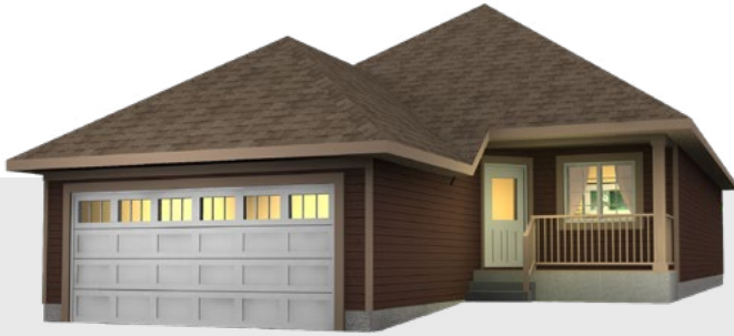
Shown in Standard elevation