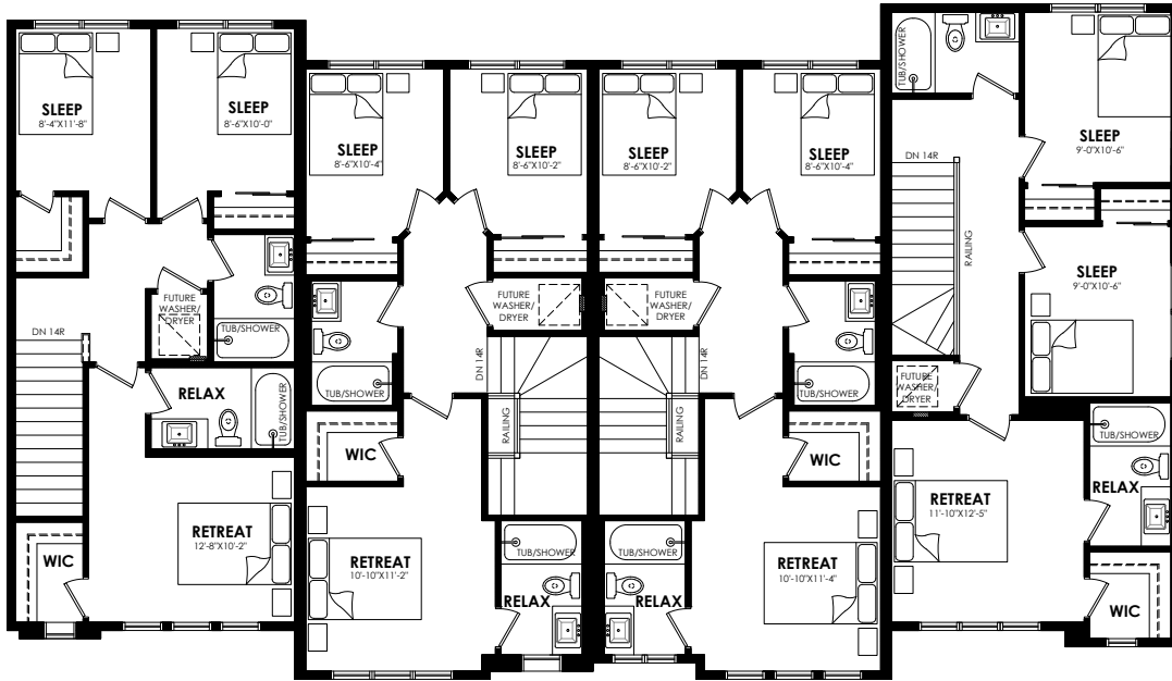
Second floor plan