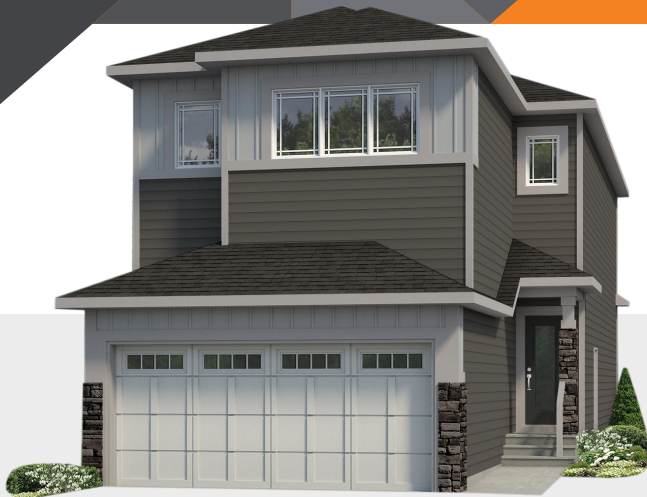
Shown in Standard elevation