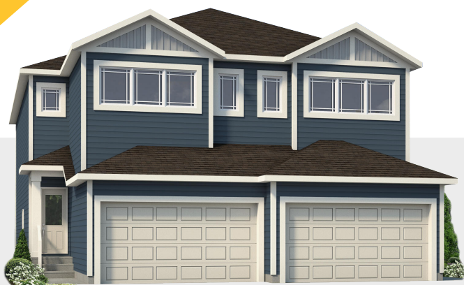
Shown in Standard elevation