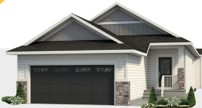
Shown in customized Craftsman elevation