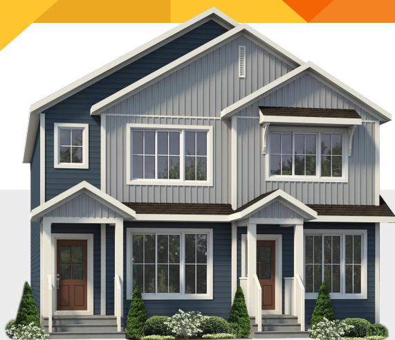
Shown in Standard elevation