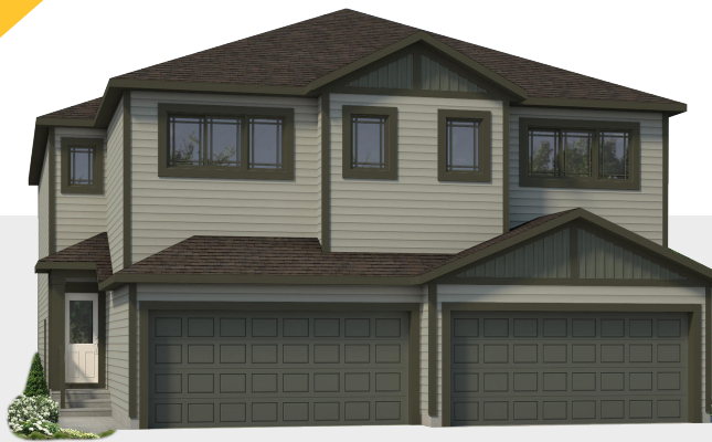
Shown in Standard elevation